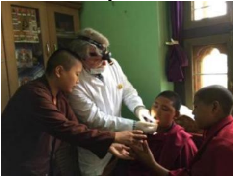
Nuns receiving dental treatment