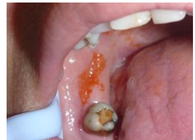
Below: Examples of the state of dental health of some of the nuns who received treatment