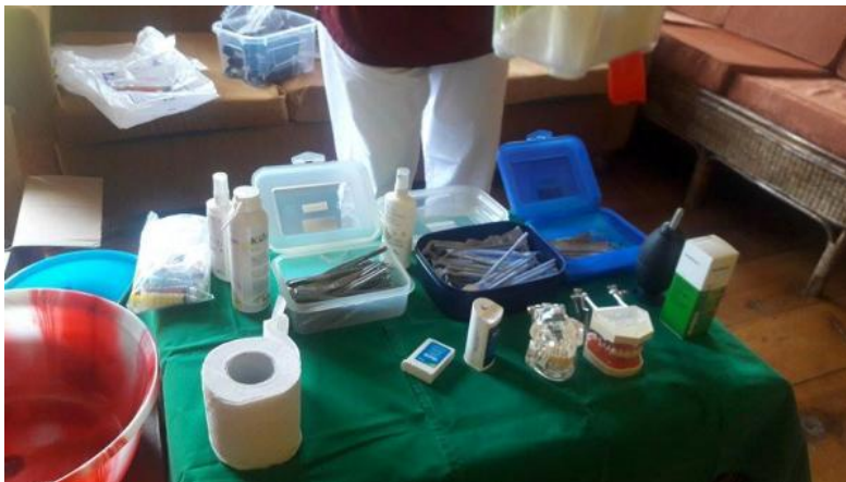
Left: Dental supplies brought along by the volunteer dentist

In the following pages are some photos of dental treatment undertaken in each of the nunneries along with details of dental treatment and dental issues of the nuns he worked on.