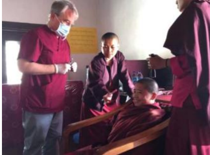
Volunteer dentist providing dental treatment to the nuns